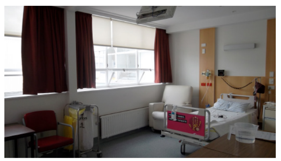
Room 25, Ward M5, Level 5 Menzies Building at Waikato Hospital

It will be necessary for you to be isolated during your admission as you will be receiving a radioactive substance which could be a health hazard to others. The room is designed to ensure as little radiation as possible is passed on to the other people nearby. During your stay you will be required to remain in your room with the door closed, by yourself, for one week.